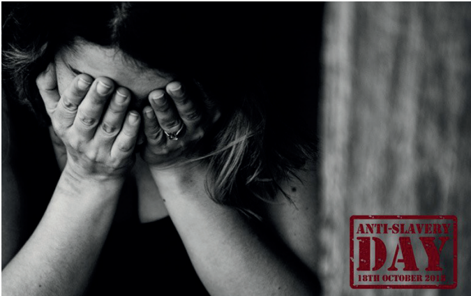
Anti-Slavery day promotion